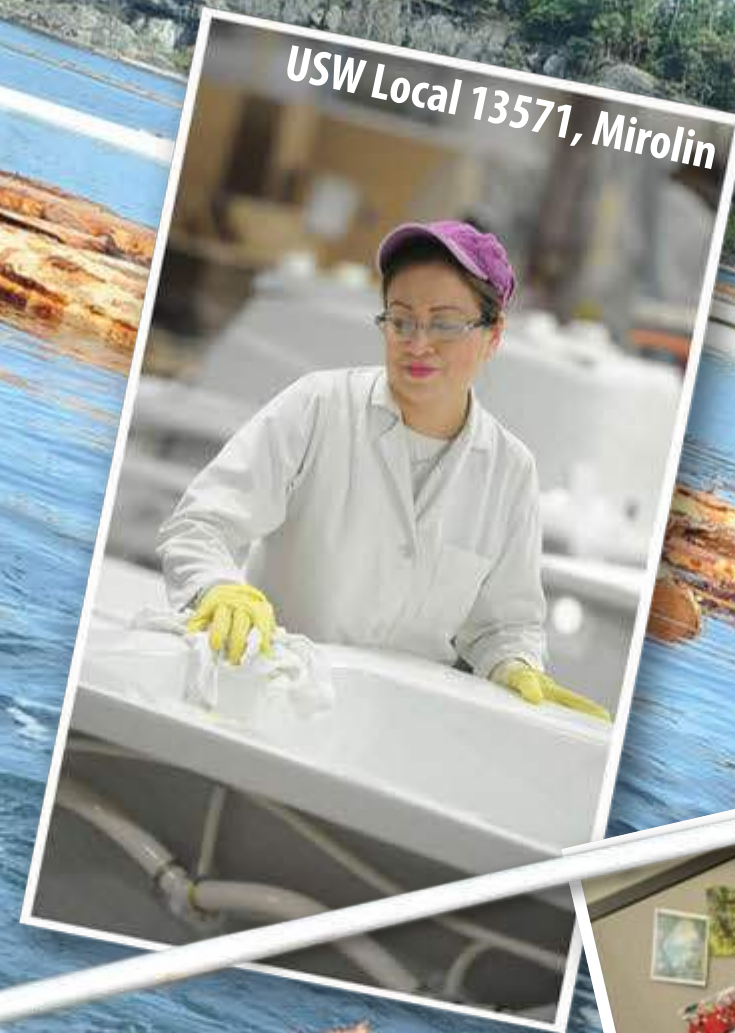
USW Local 13571, Mirolin