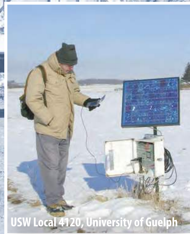
USW Local 4120, University of Guelph

"There are just as many guys who are afraid of spiders and heights, so there's no reason why women can't do this job," she laughs.