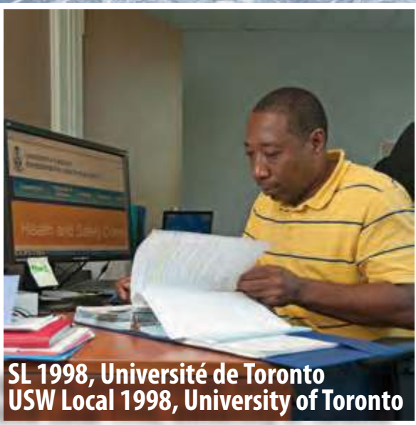
SL 1998, Université de Toronto USW Local 1998, University of Toronto