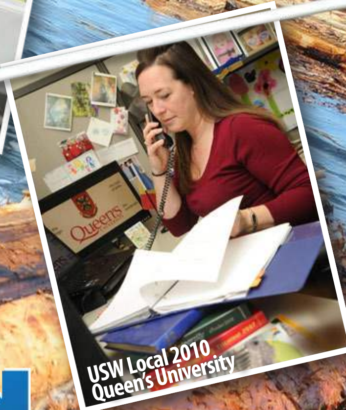
USW Local 2010 Queen's University