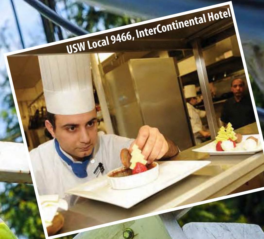
USW Local 9466, InterContinental Hotel