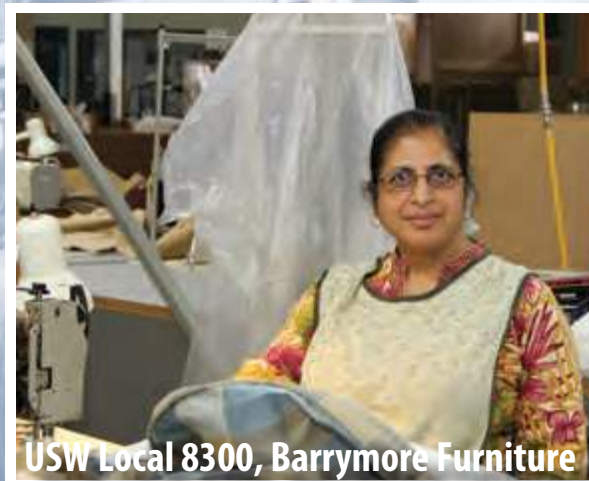
USW Local 8300, Barrymore Furniture