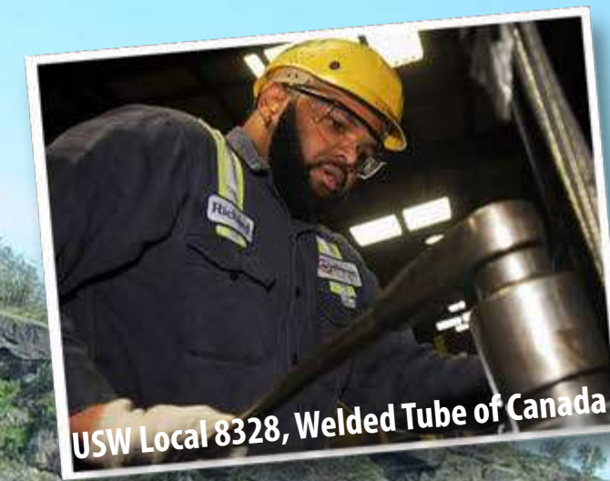
USW Local 8328, Welded Tube of Canada