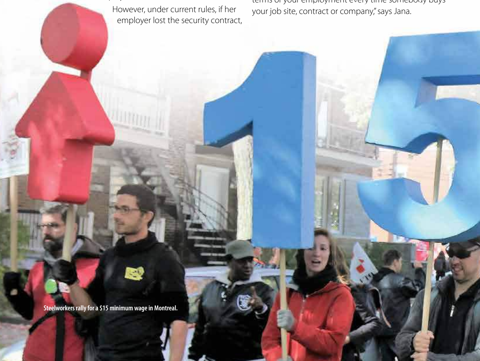
Steelworkers rally for a $15 minimum wage in Montreal.