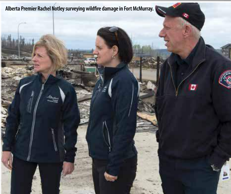
Alberta Premier Rachel Notley surveying wildfire damage in Fort McMurray.

Photo: Government of Alberta, used under CC BY-ND 2.0