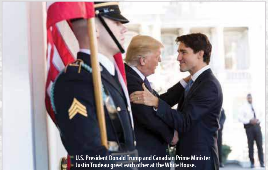
U.S. President Donald Trump and Canadian Prime Minister Justin Trudeau greet each other at the White House.

The Liberals have refused to end the massive, illegal dumping of