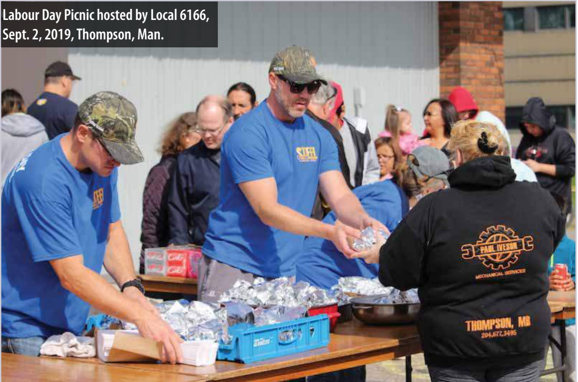
Labour Day Picnic hosted by Local 6166, Sept. 2, 2019, Thompson, Man.

During the annual holiday in September, USW Local 6166 celebrated the achievements of labour with a BBQ and children's activities. The local also took the opportunity to distribute handouts and surveys about our union. The event featured speeches from USW leaders, political guests and more.