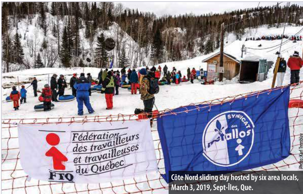
Côte Nord sliding day hosted by six area locals, March 3, 2019, Sept-Îles, Que.