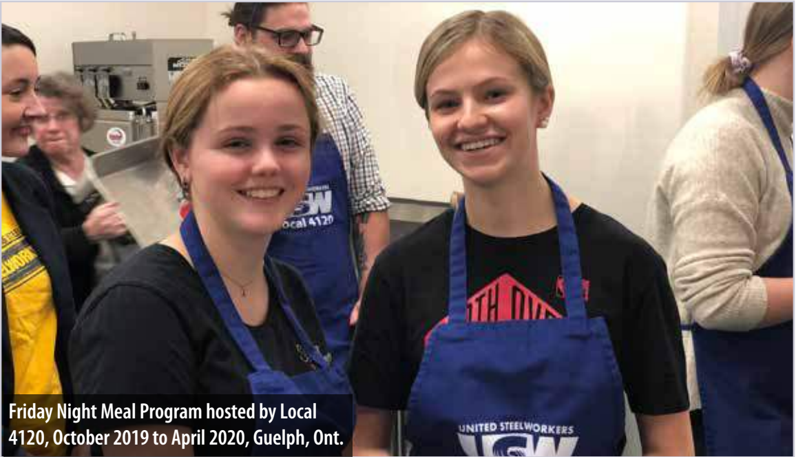
Friday Night Meal Program hosted by Local 4120, October 2019 to April 2020, Guelph, Ont.