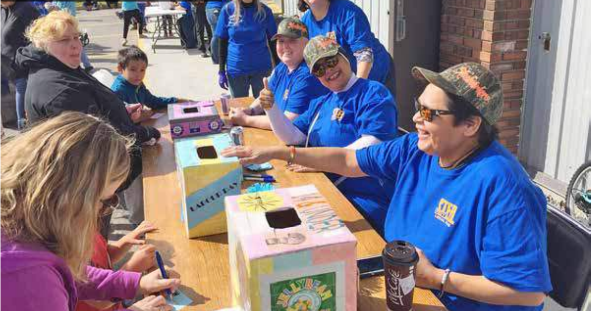
Labour Day Picnic hosted by Local 6166, Sept. 2, 2019, Thompson, Man.