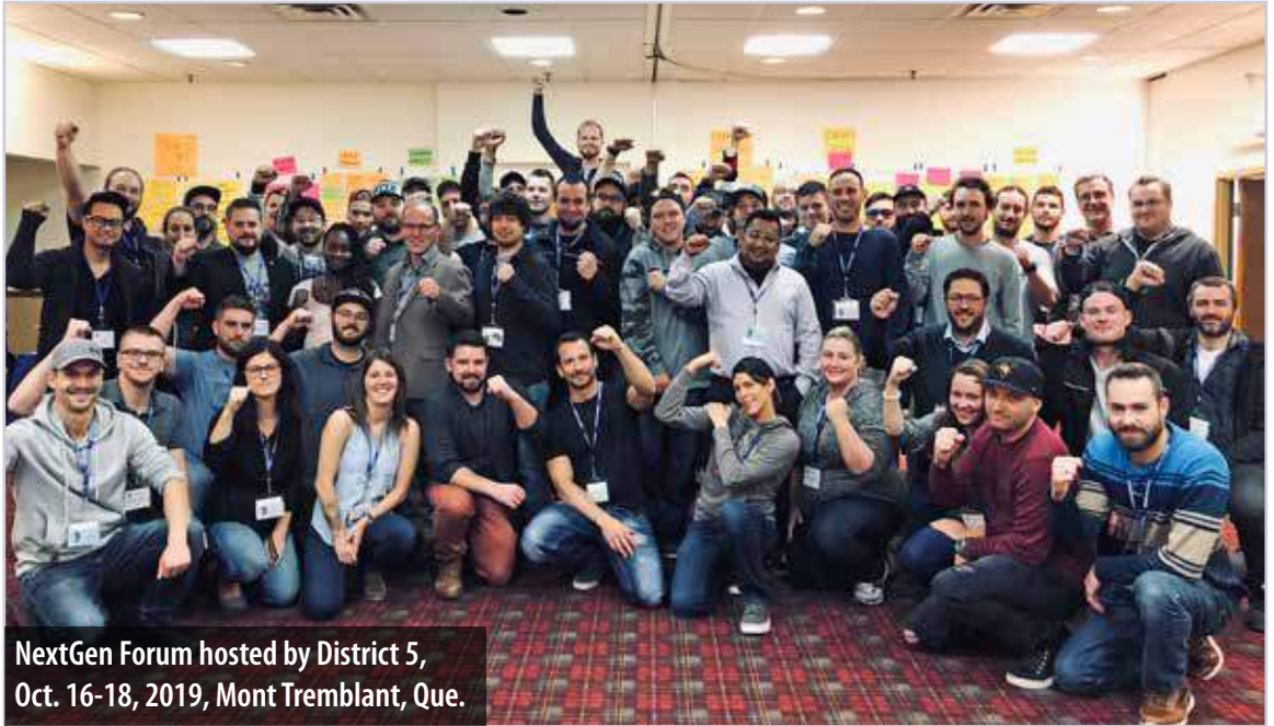
NextGen Forum hosted by District 5, Oct. 16-18, 2019, Mont Tremblant, Que.