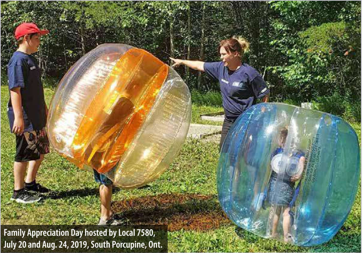
Family Appreciation Day hosted by Local 7580, July 20 and Aug. 24, 2019, South Porcupine, Ont.