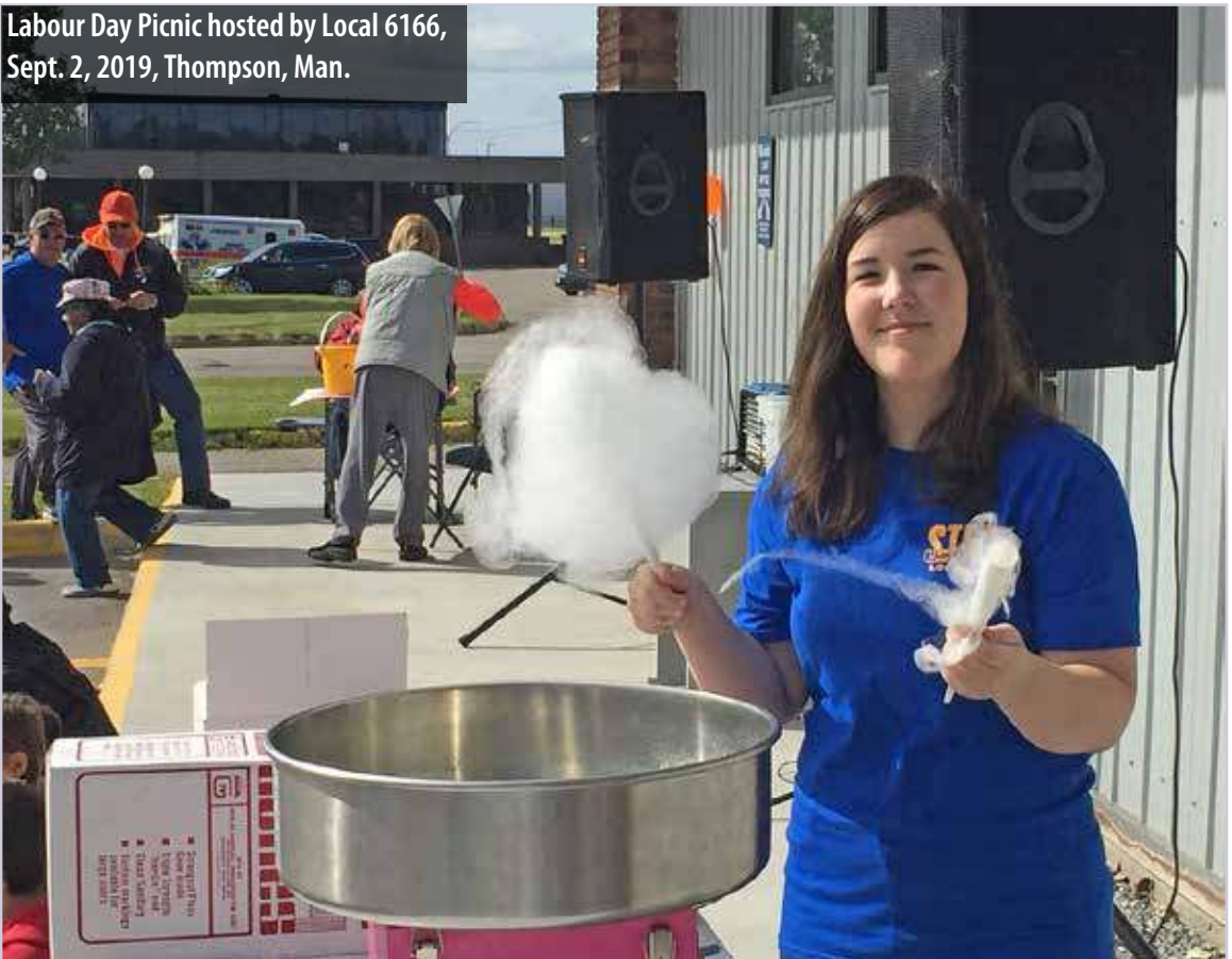
Labour Day Picnic hosted by Local 6166, Sept. 2, 2019, Thompson, Man.

It is important to highlight the work of the District Education Co-ordinators and the Project Review Subcommittee who have been tasked with making hard decisions. And we must also not forget that all of these projects rest on the creativity, commitment and volunteer labour of local unions and their activists. It is because of them that USW activities will continue to flourish and benefit our members, families and communities as we move forward.