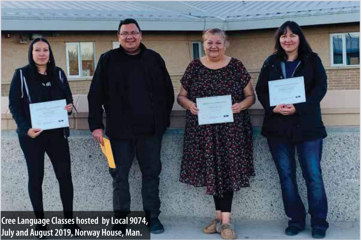
Cree Language Classes hosted by Local 9074, July and August 2019, Norway House, Man.