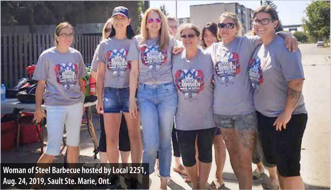
Woman of Steel Barbecue hosted by Local 2251, Aug. 24, 2019, Sault Ste. Marie, Ont.