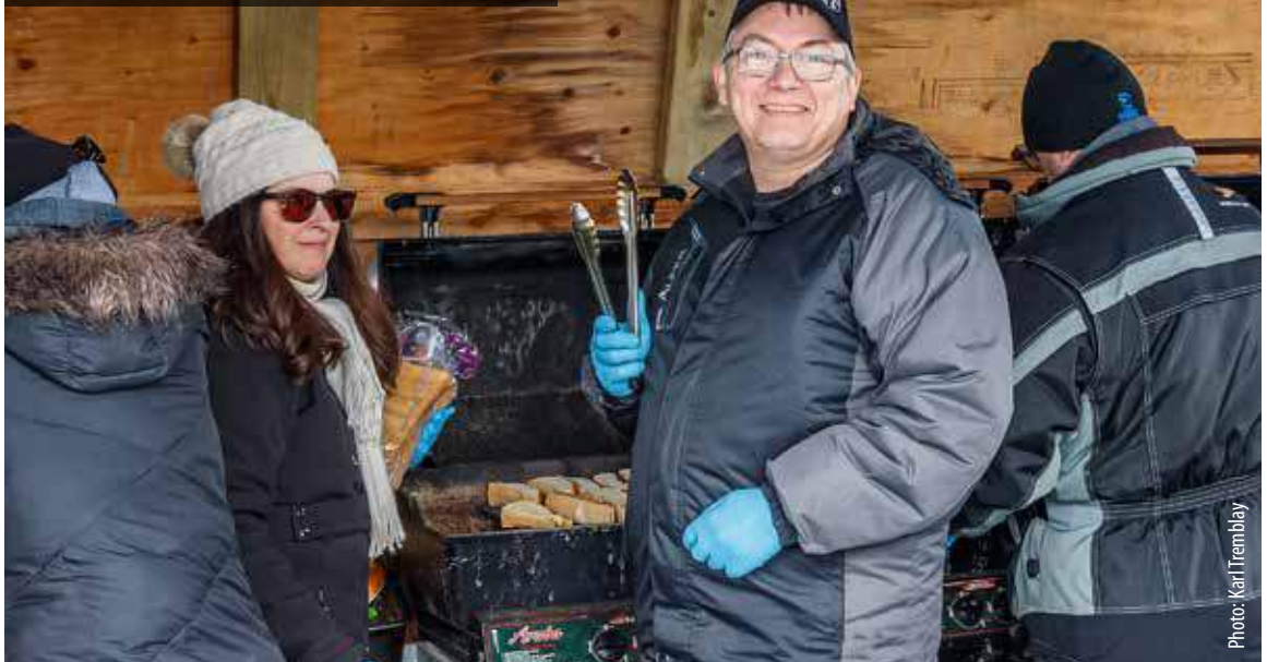
Côte Nord sliding day hosted by six area locals, March 3, 2019, Sept-Îles, Que.

In 2019, 11 projects of $5,000 or less and 12 projects of more than $5,000 were approved. A short description of most of them are included in the following pages.