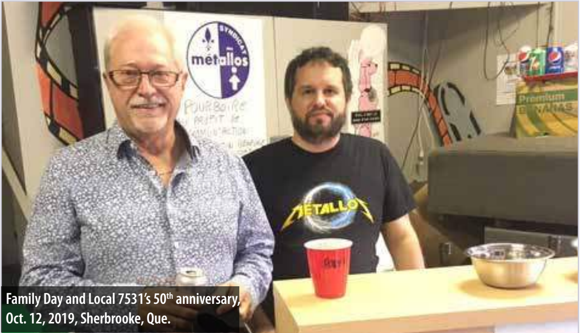
Family Day and Local 7531's 50 th anniversary, Oct. 12, 2019, Sherbrooke, Que.