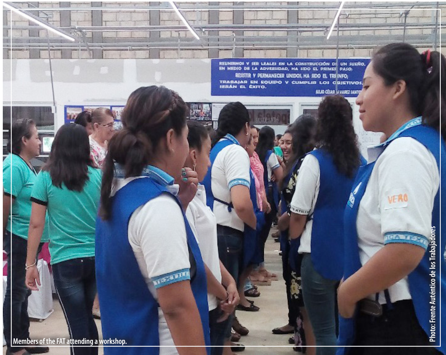
Members of the FAT attending a workshop.