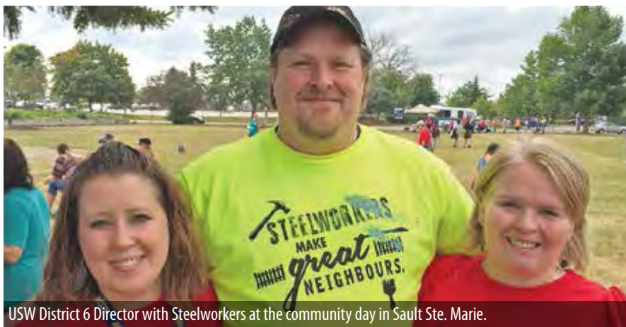
USW District 6 Director with Steelworkers at the community day in Sault Ste. Marie.

The August gathering in Sault Ste. Marie was one of the largest District 6 conferences ever. More than 400 delegates made the trek to the Sault, where the week was like no other in Steelworkers history.