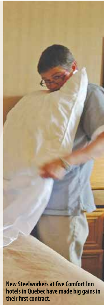
New Steelworkers at five Comfort Inn hotels in Quebec have made big gains in their first contract.

"After we joined the union, it soon became clear that our efforts were well worth it. We all stand together, like one big family," she said. ■