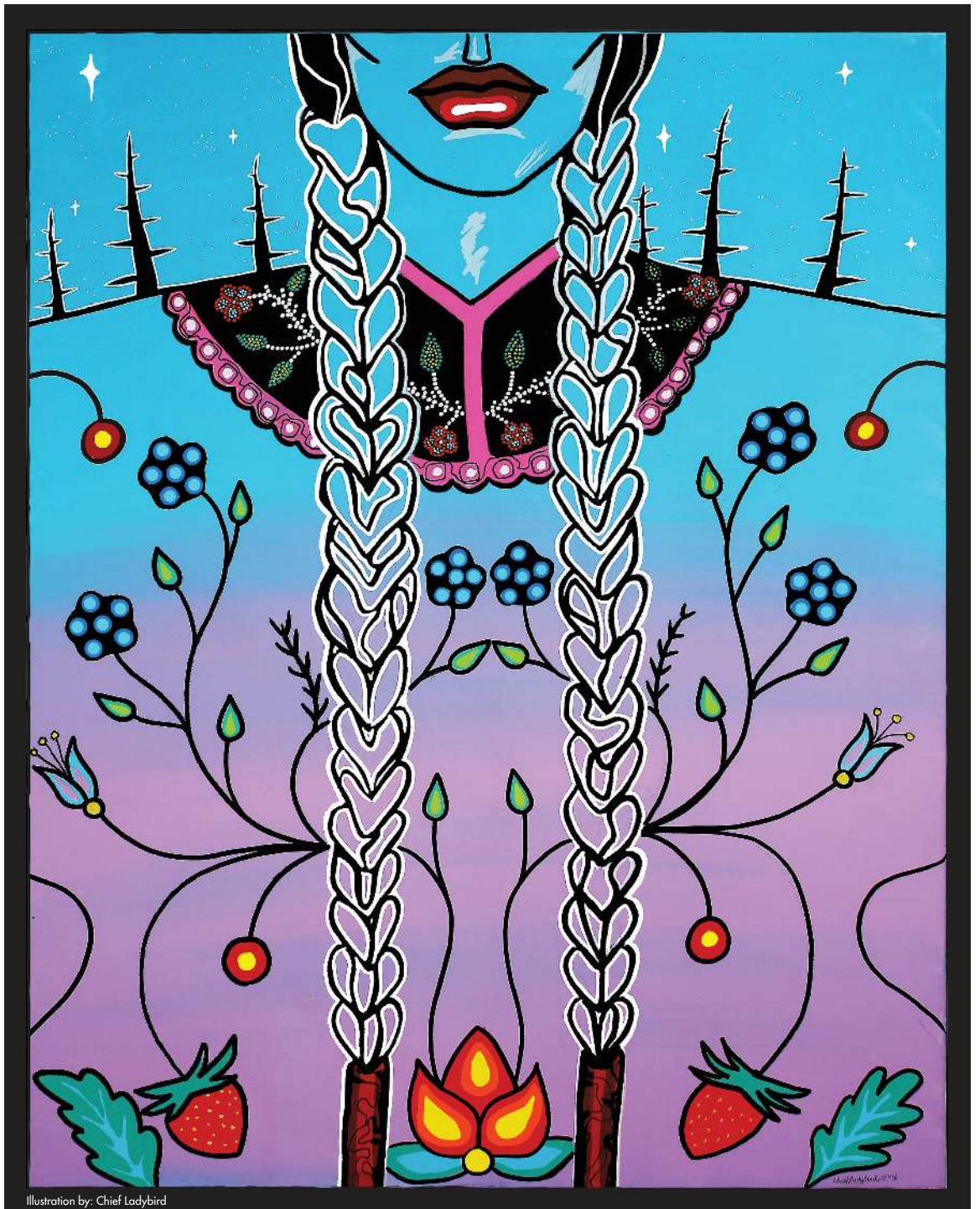
Illustration by: Chief Ladybird