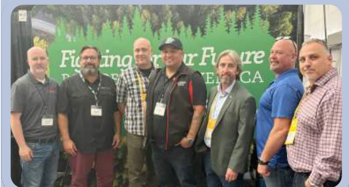
The USW joined Unifor and PPWC at the Union of B.C. Municipalities conference to fight for forestry jobs.