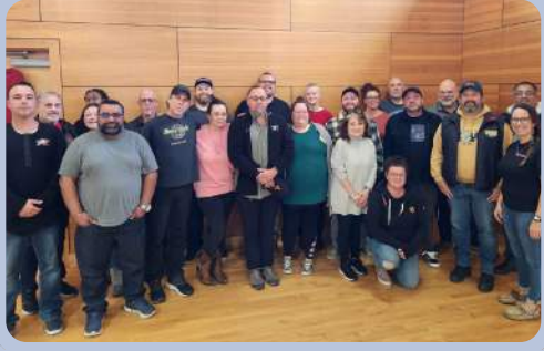
Members from Local 1-1937, 1944, 1-417 and 2009 spent a week in Langley, B.C., attending the Unionism on Turtle Island course.