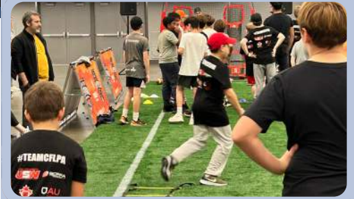
The USW was proud to be a co-sponsor of the Canadian Football League Players' Association (CFLPA) Grey Cup Kids camp where kids learned from current and former CFL players and got to see the Grey Cup.